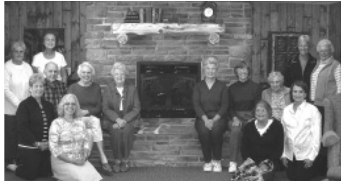
The Friends held their September meeting at the newly expanded Boyne Falls branch and were impressed with the new look.